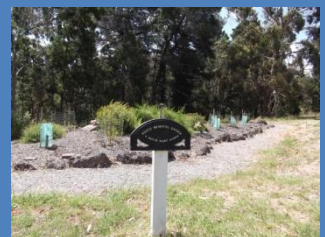
Ashes Memorial Garden